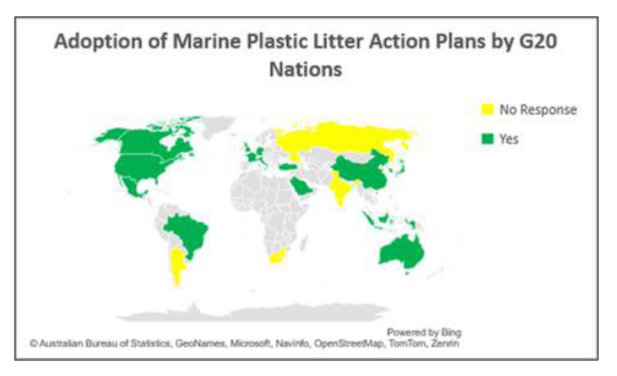
Figure 1: Adoption of Marine Plastic Litter Action Plans by G20 Nations